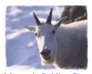
Mountain Publius Goat

"The American people will never knowingly adopt Socialism. But under the name of liberalism they will adopt every fragment of the Socialist program, until one day America will be a Socialist nation without knowing how it happened." Norman Thomas